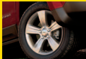
17-inch Painted Aluminum Patriot Limited (Standard)