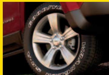
17-inch Painted Aluminum Patriot Sport (Available)