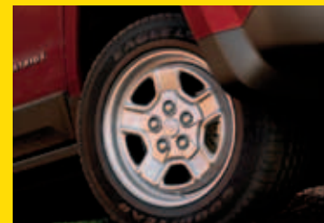
16-inch Styled Steel Patriot Sport (Standard)