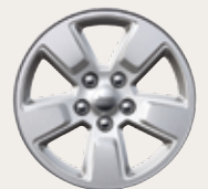
16-inch Aluminum (standard on FWD models)

FREEDOM DRIVE II® OFF-ROAD GROUP: Continuously Variable Transaxle II Low (CVT2L) automatic with 19:1 crawl ratio, 4-wheel drive Off-Road mode and Hill Descent Control with grade-sensing, HSA, Brake-Lock Differential, skid plates on fuel tank, transmission and engine oil pan, 2 front and 1 rear tow hooks, trailer-tow wiring harness, 140-amp alternator, 4-way manual driver-seat height adjuster, bright exhaust tip, engine oil cooler, all-season floor mats, full-size spare tire, Trail Rated® badge and 17-inch Tech Silver aluminum wheels with P215/65R17 All-Terrain tires (requires 2.4L engine; 4x4 models only)