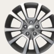
18-inch Polished Aluminum with Mineral Gray Pockets (available)