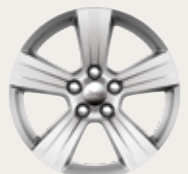
17-inch Tech Silver Aluminum (standard on 4x4 models)