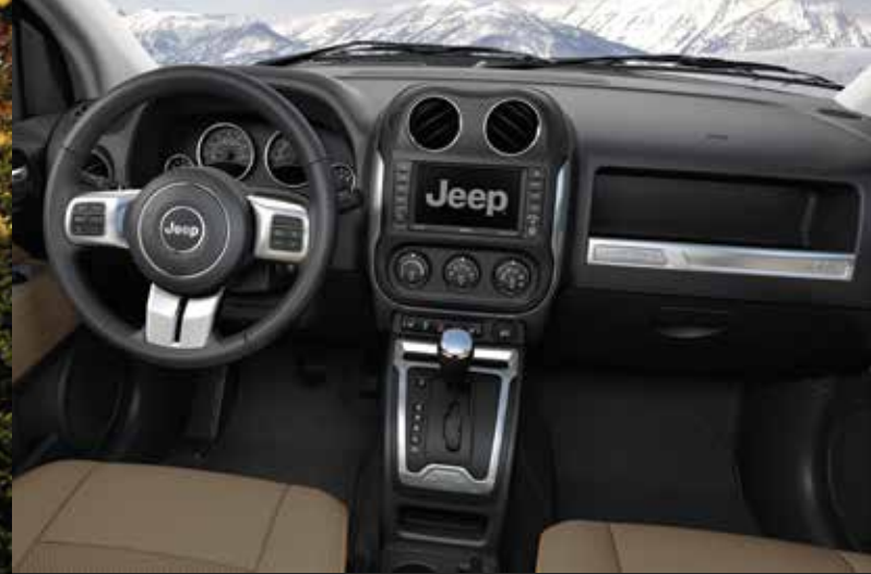
INTERIOR: 1) McKinley Vinyl/Sport Mesh Cloth with Tangerine accent stitching; Light Pebble Beige (standard) 2) McKinley Vinyl/Sport Mesh Cloth with Light Slate Gray accent stitching; Dark Slate Gray/Black (standard)