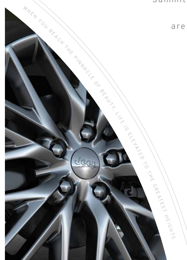
WHEN YOU REACH THE PINNACLE OF BEAUTY, LIFE IS ELEVATED TO THE GREATEST HEIGHTS