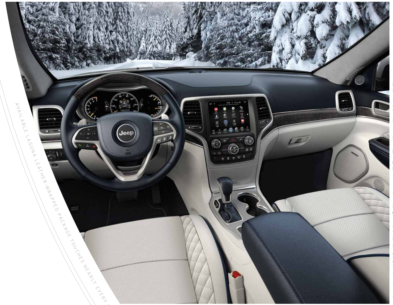
AVAILABLE LAGUNA LEATHER-WRAPPED PACKAGE TOUCHES NEARLY EVERY CABIN SURFACE