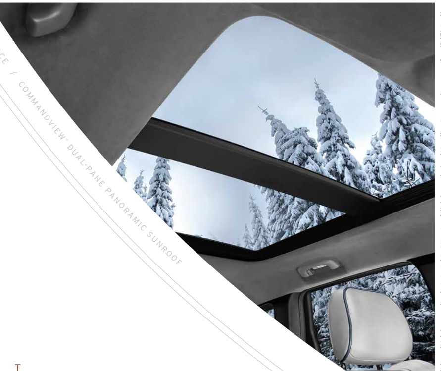
COMMANDVIEW® DUAL-PANE PANORAMIC SUNROOF