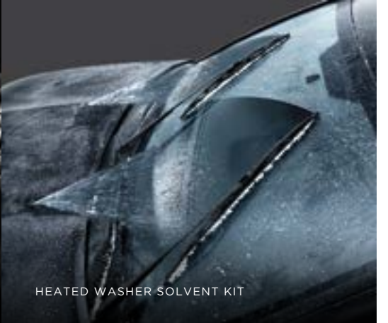
HEATED WASHER SOLVENT KIT