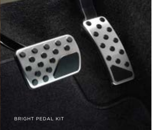
BRIGHT PEDAL KIT