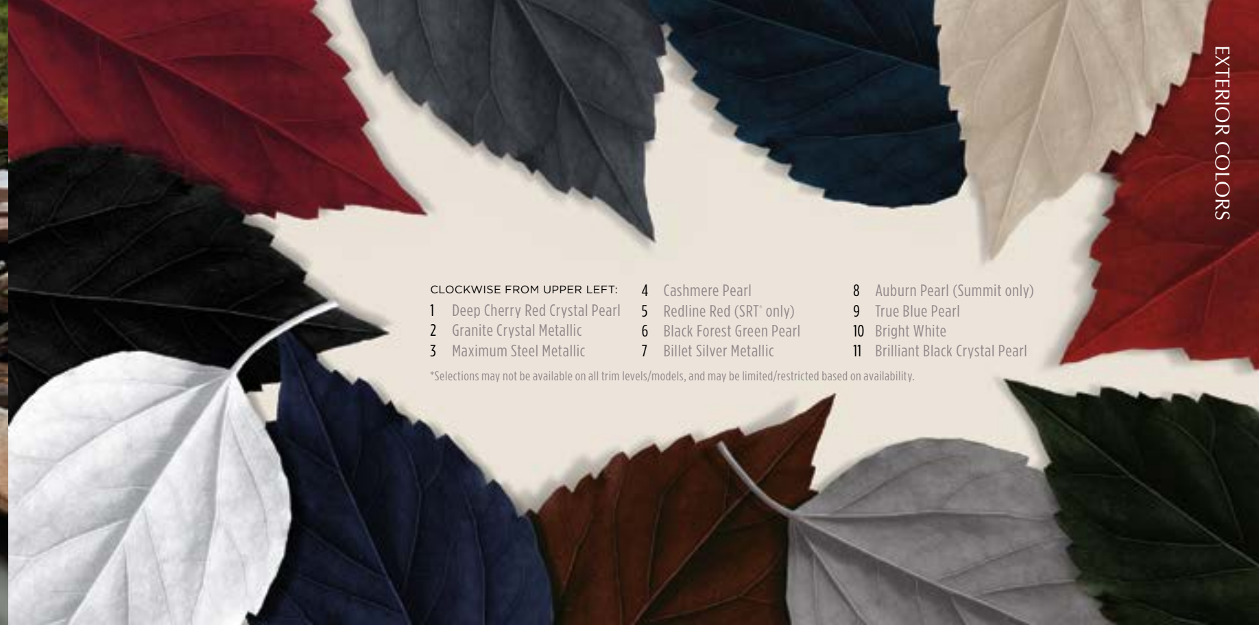
CLOCKWISE FROM UPPER LEFT: 1 Deep Cherry Red Crystal Pearl 4 Cashmere Pearl 8 Auburn Pearl (Summit only) 2 Granite Crystal Metallic 5 Redline Red (SRT® only) 9 True Blue Pearl 3 Maximum Steel Metallic 6 Black Forest Green Pearl 10 Bright White 7 Billet Silver Metallic 11 Brilliant Black Crystal Pearl

*Selections may not be available on all trim levels/models, and may be limited/restricted based on availability.