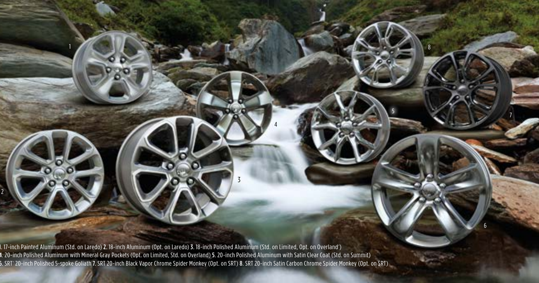
1. 17-inch Painted Aluminum (Std. on Laredo) 2. 18-inch Aluminum (Opt. on Laredo) 3. 18-inch Polished Aluminum (Std. on Limited, Opt. on Overland) 4. 20-inch Polished Aluminum with Mineral Gray Pockets (Opt. on Limited, Std. on Overland) 5. 20-inch Polished Aluminum with Satin Clear Coat (Std. on Summit) 6. SRT® 20-inch Polished 5-spoke Goliath 7. SRT 20-inch Black Vapor Chrome Spider Monkey (Opt. on SRT) 8. SRT 20-inch Satin Carbon Chrome Spider Monkey (Opt. on SRT)