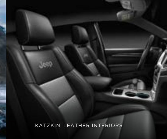
KATZKIN® LEATHER INTERIORS