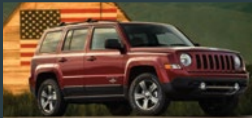
JEEP® PATRIOT FREEDOM EDITION