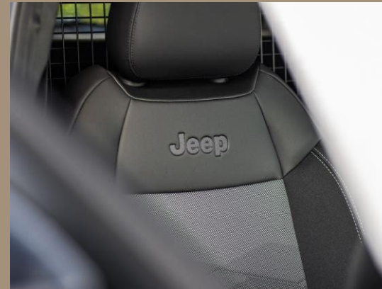
Standard Upholstery Robin Cloth / Vinyl with Grey Accents

All pictures for illustration purposes only