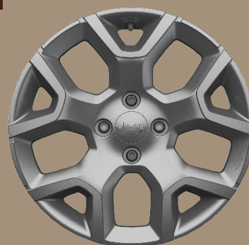
Altitude Standard Wheel 17" Full Painted Alloy