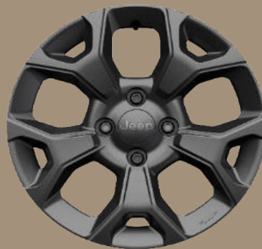
Longitude Standard Wheel 16" Painted Alloy