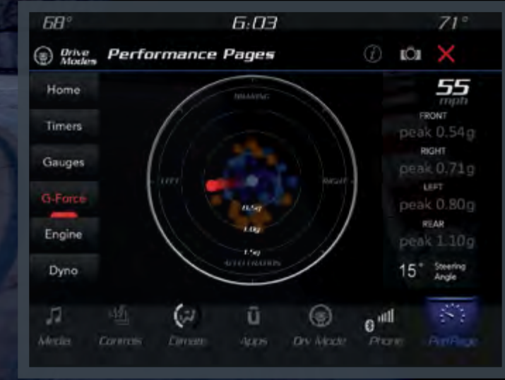
PERFORMANCE PAGES: G-FORCE HEAT MAP

SIMPLY EXHILARATING. LEAN IN. OWN EVERY CURVE.