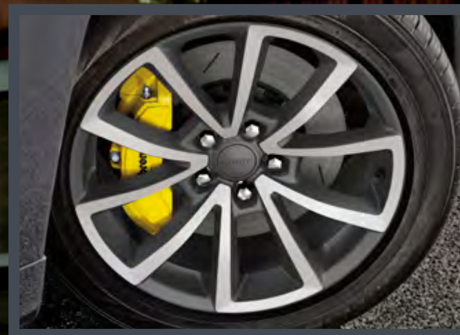
HIGH-PERFORMANCE 6-PISTON BREMBO® CALIPER

THE MORNING SKY OPENS. PRESS ON. TIME WILL NOT WAIT.