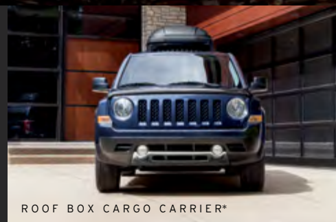
ROOF BOX CARGO CARRIER*