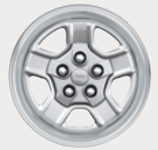
16-inch Styled Steel (standard)

SMOKER'S GROUP: Removable ashtray and lighter element