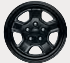
16-inch Black Steel (available)