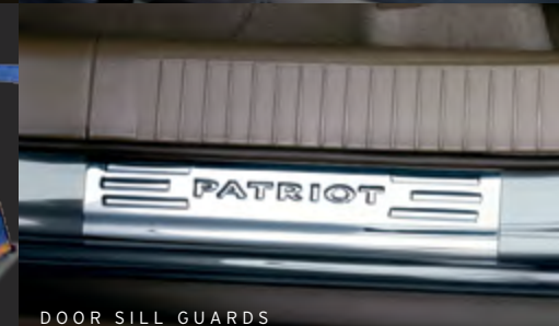
DOOR SILL GUARDS