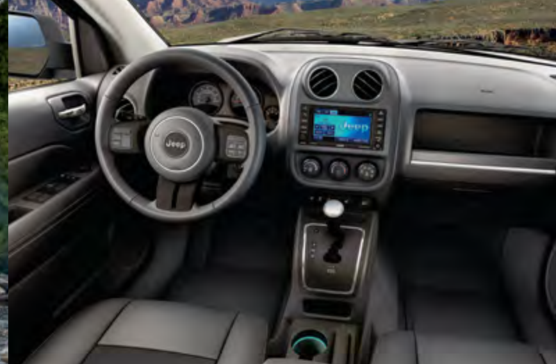
INTERIOR: 1) McKinley Vinyl/Sport Mesh Cloth with Light Slate Gray accent stitching — Dark Slate Gray/Black (standard)