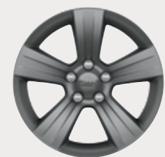
17-inch Mineral Gray Aluminum (standard)

SMOKER'S GROUP: Removable ashtray and lighter element