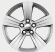
17-inch Tech Silver Aluminum (available)