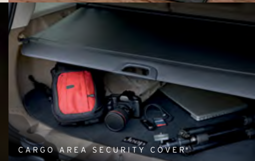
CARGO AREA SECURITY COVER*