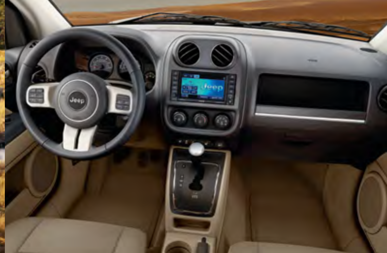
INTERIOR: 1) Duet Cloth/Cubic Cloth — Light Pebble Beige (standard) 2) Duet Cloth/Cubic Cloth — Dark Slate Gray (standard)