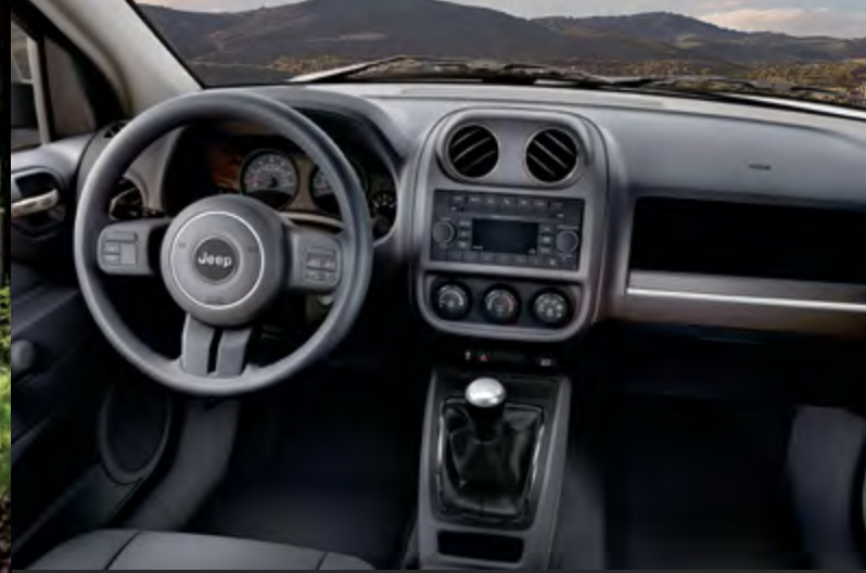
INTERIOR: 1) Duet Cloth/Cubic Cloth — Light Pebble Beige (standard) 2) Duet Cloth/Cubic Cloth — Dark Slate Gray (standard)