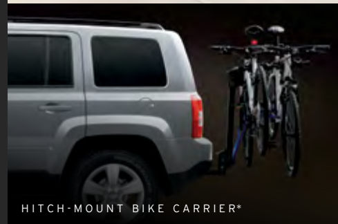
HITCH-MOUNT BIKE CARRIER*