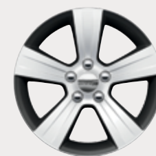
17-inch Polished Aluminum with Granite Painted Pockets (standard)

SMOKER'S GROUP: Removable ashtray and lighter element