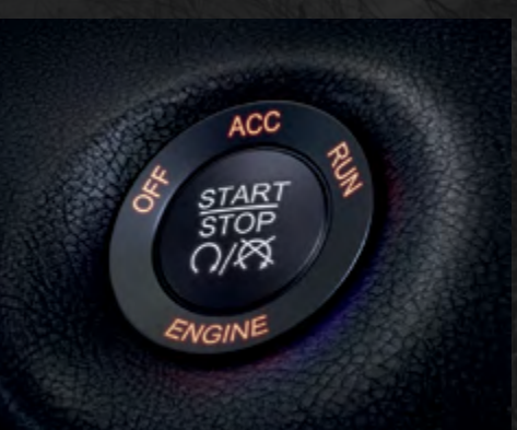
The available Keyless Enter 'n Go™ means no more fumbling for keys to get going.