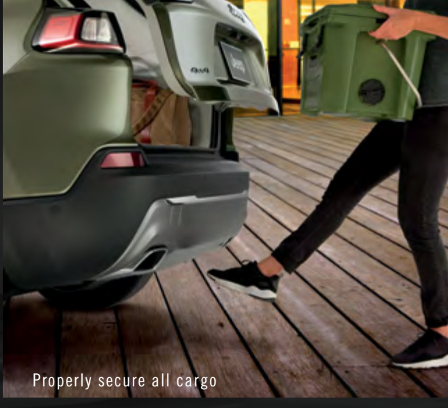
New! When your hands are full, easily open the rear liftgate with a swipe of your foot. A convenient available feature.