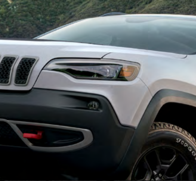
The 2019 Cherokee features a new front end and LED headlamps that shine bright and far, for safe driving day and night.