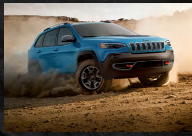
Cherokee Trailhawk arrives with Trail Rated® Jeep<sub>®</sub> Active Drive Lock 4WD, with the improved traction capability to dig in deep, thanks to its electronic rear axle lock.