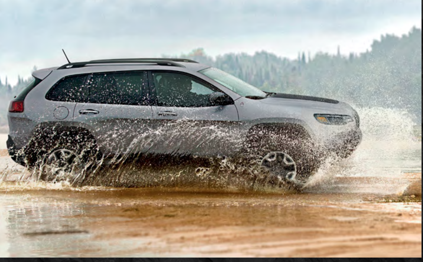
Every Cherokee 4x4 is equipped with the Selec-Terrain® Traction Management System, including the exclusive Rock Mode on Trailhawk.® Match your capability to your adventurous nature and the road conditions you meet along the way.