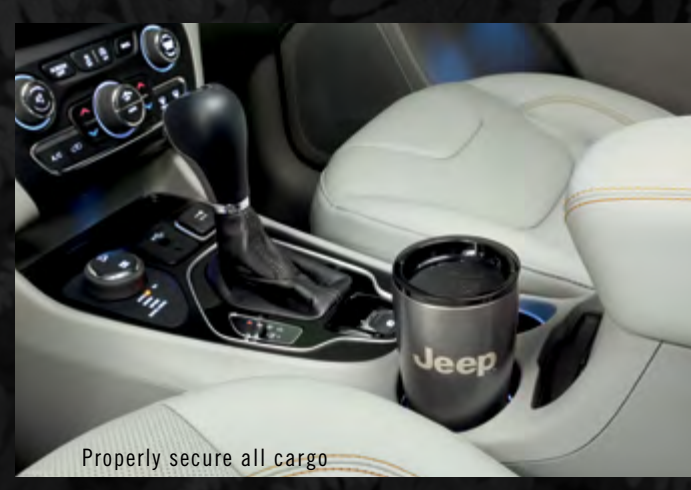
The larger premium console includes convenient storage cubbies and cup holders.

The new available full-color 7-inch Driver Information Display is a convenient feature that provides real-time vehicle stats along with safety and performance data.