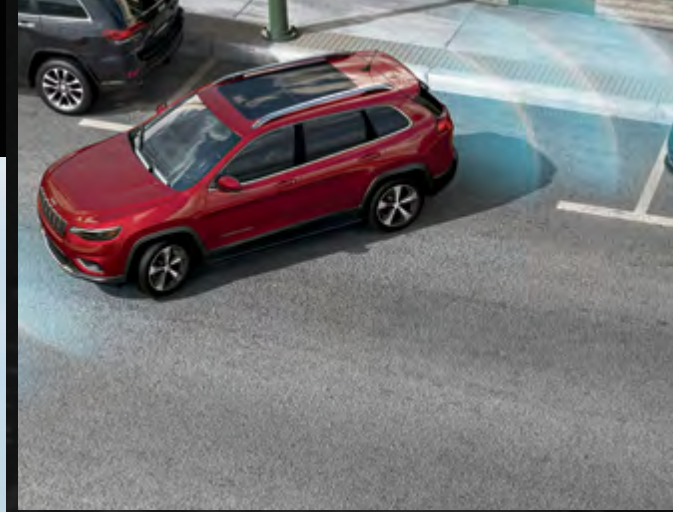
Parallel and Perpendicular Park Assist<sup>4</sup> actively guides steering to help you ease into parking spots. Available.