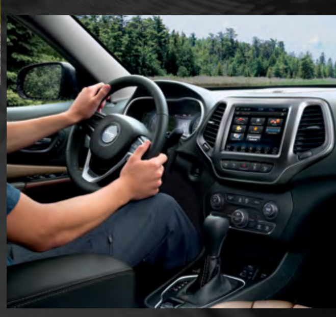
Advanced technology aids safe travel, including available 4G Wi-Fi<sup>3</sup>