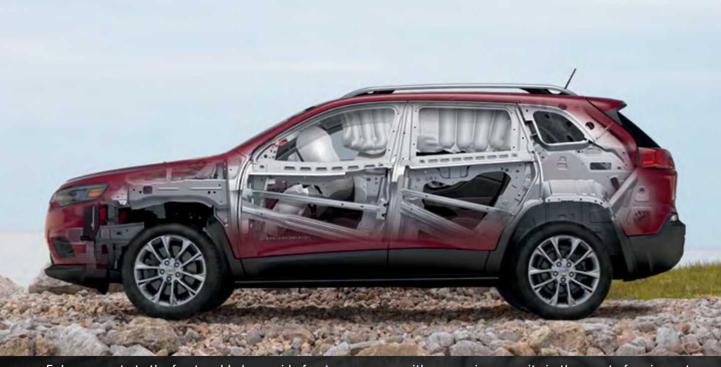
Enhancements to the front end help provide front passengers with reassuring security in the event of an impact.

Forward Collision Warning - Plus with Active Braking<sup>5</sup> detects fast approaches to objects and vehicles, and provides alerts and brake assistance if the driver does not react in time. Available.