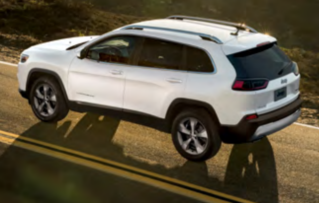
The new liftgate is crafted from strong, lightweight materials for improved efficiency.