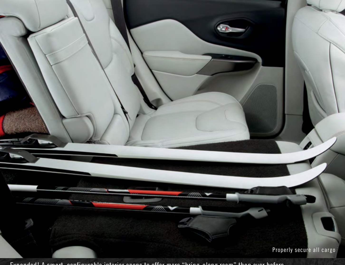
Expanded! A smart, configurable interior opens to offer more "bring-along room" than ever before.