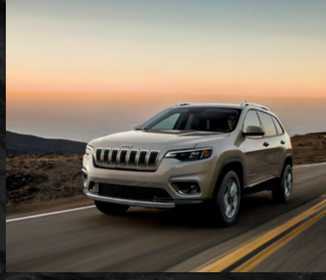
Premium performance is yours, with the available 2.0L Turbo I-4 engine. At 270 hp and 295 lb-ft of torque, it has the power of much larger engines, yet delivers incredible efficiencies.