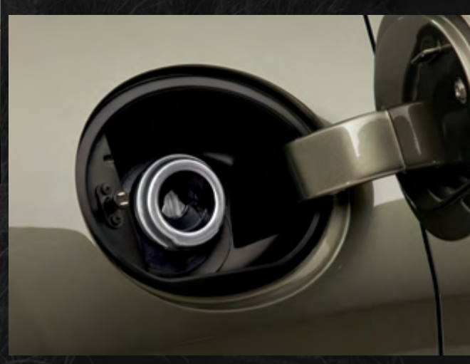
New! The convenient capless fuel-filler door helps keep your hands clean.